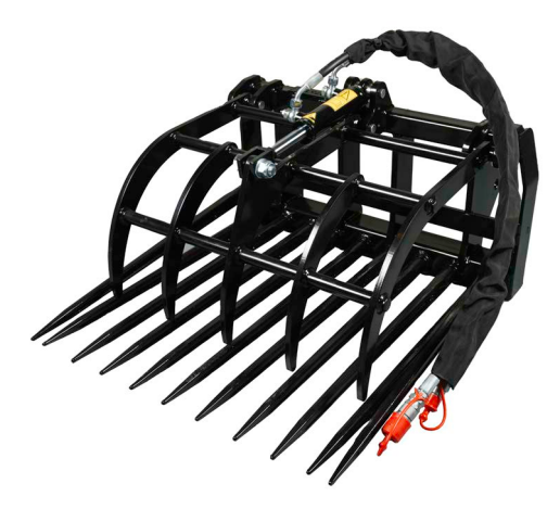
PINBUCKET WITH CLAMP